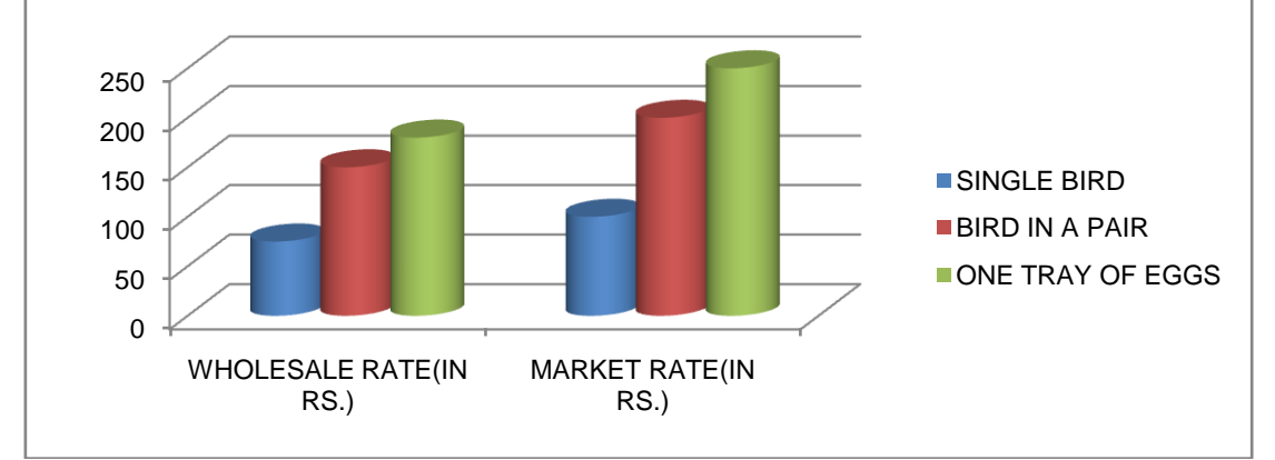
Fig.5.8- Showing A 3d Graphical Representation of the Wholesale and Market Values in Dimapur, Nagaland

1. Market rate of one tray of eggs = Rs.250/-2.